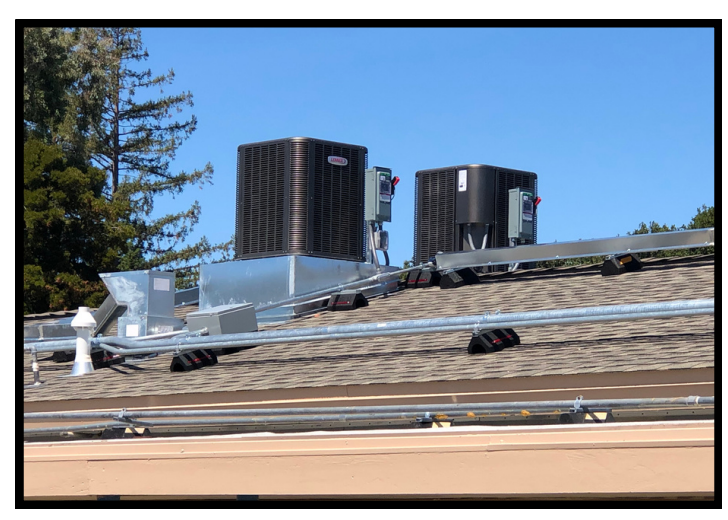
Pictured above are the new HVAC units at West School

As of now, our contractors and district staff are wrapping up miscellaneous tasks prior to closing out the roofing and HVAC projects at North and West.